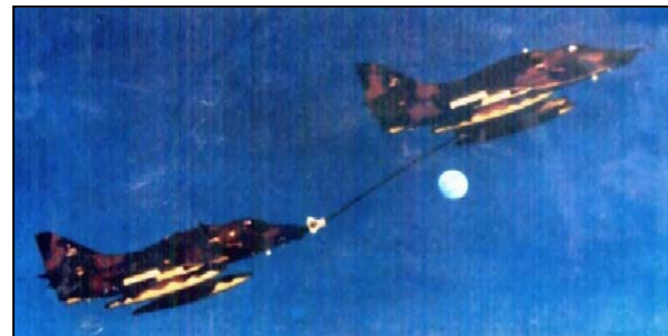
Malaysian A-4s Night Refueling with Buddy Store

Operating Altitude Range: Sea Level to 40,000 ft (12,192 m) Operating Temperature Range: -65° to +160°F (-54° to +71°C) Operating Air Speed: 200-325 KIAS Emergency Provisions: Hose Guillotine, Jettison, and Sealing; Pod Jettison; Fuel Dump Mode