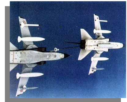
German Air Force Tornado Refueling Italian Air Force Tornado with Buddy-Buddy Store

Diameter: 28 in (71cm) Length Overall: 220.47 inches (559.99 cm) Mounting: Fuselage Centerline, Crutchless Suspension Fuel Capacity: 300 U.S. Gallons (1136 Liters) Empty Weight: 725 lb (329 kg) National Stock Numbers: 1560-01-146-9551 1560-01-146-9552 1560-01-146-9553 Technical Manual: (German Air Force Publications) 6A99-2BXC 1-2, 6A99-2BXC 1-3 6A99-2XC 1-4 Aircraft Applications: Panavia Tornado